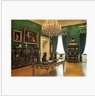
Large Drawing Room - Contains some of the most spectacular works by the French furniture-maker, Andre-Charles Boulle