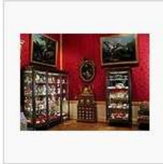
Part of the Wallace Collection's great ensemble of Sèvres porcelain