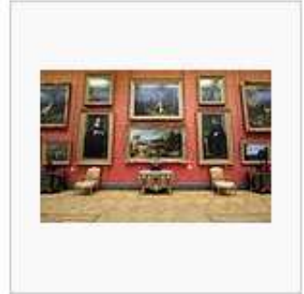
The Great Gallery in 2012, featuring Rubens' "Landscape With A Rainbow", portraits by Van Dyck, and other important works

The Wallace Collection is split into six curatorial departments, Pictures and Miniatures, Ceramics and Glass, Sculpture and Works of Art, Arms and Armour, Sèvres porcelain and Gold Boxes and Furniture.