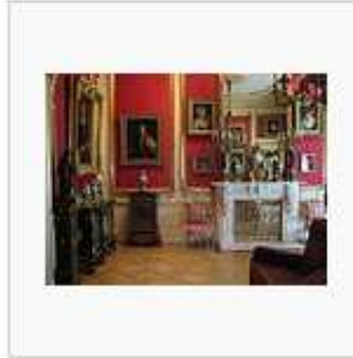
Front State Room - Redecorated in the mid- 1990s to appear as though it would have in the late- 19th century